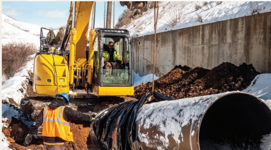
Ductile iron pipe being installed without concerns in subfreezing snowy conditions

Conversely, Ductile iron pipes' safe working range without concern is from -40°F to 212°F, without any adverse effect on the pipes' rating or wall strength. No questions or qualifiers asked or needed. DI can be used for higher temps, such as experienced in steam lines, up to 300°F, without cement lining and with different gaskets.